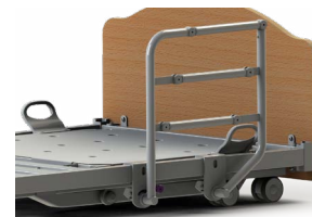
Self-Assist rail - fold down