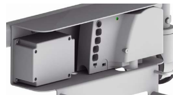
Battery back-up unit